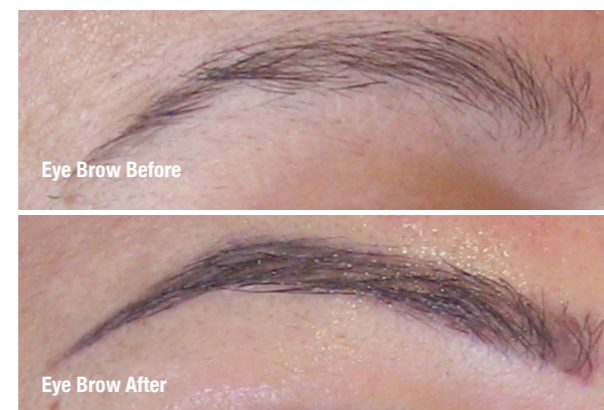
before and after photographs courtesy of Selina Lam of Beauty Access

Eyebrow shape can be designed to give an illusion of an eyebrow lift to open up the eyes, especially if the eyelids are droopy, to give a more youthful appearance. Full eyebrows or individual hairs can be created, depending on the state of your eyebrows and your request, to give softer, more natural looking eyebrows.