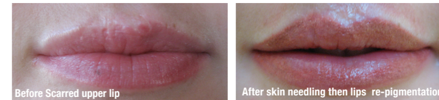
before and after photographs courtesy of Selina Lam of Beauty Access

Cosmetic tattooing of the lips restores their fullness, gives a youthful appearance and enhances definition. Lips can be re-defined to give a natural line and prevent lipstick bleeding or ever having to re-apply lipstick after eating.